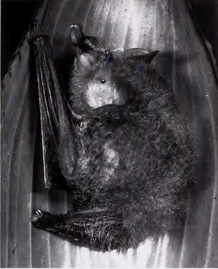
Fig. 1. New World disk-winged bat Thyroptera discifera caught at La Selva, Costa Rica, in April 1998. Note sparse, long hairs at uropatagium.